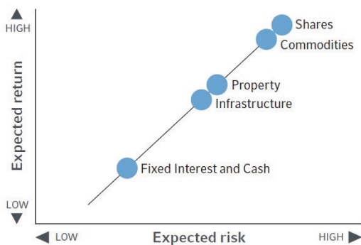
Position on risk/return spectrum