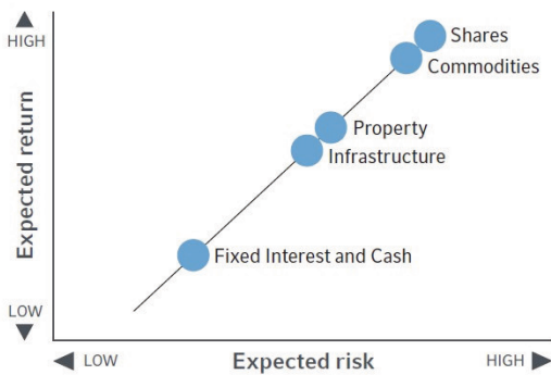
Position on risk/return spectrum